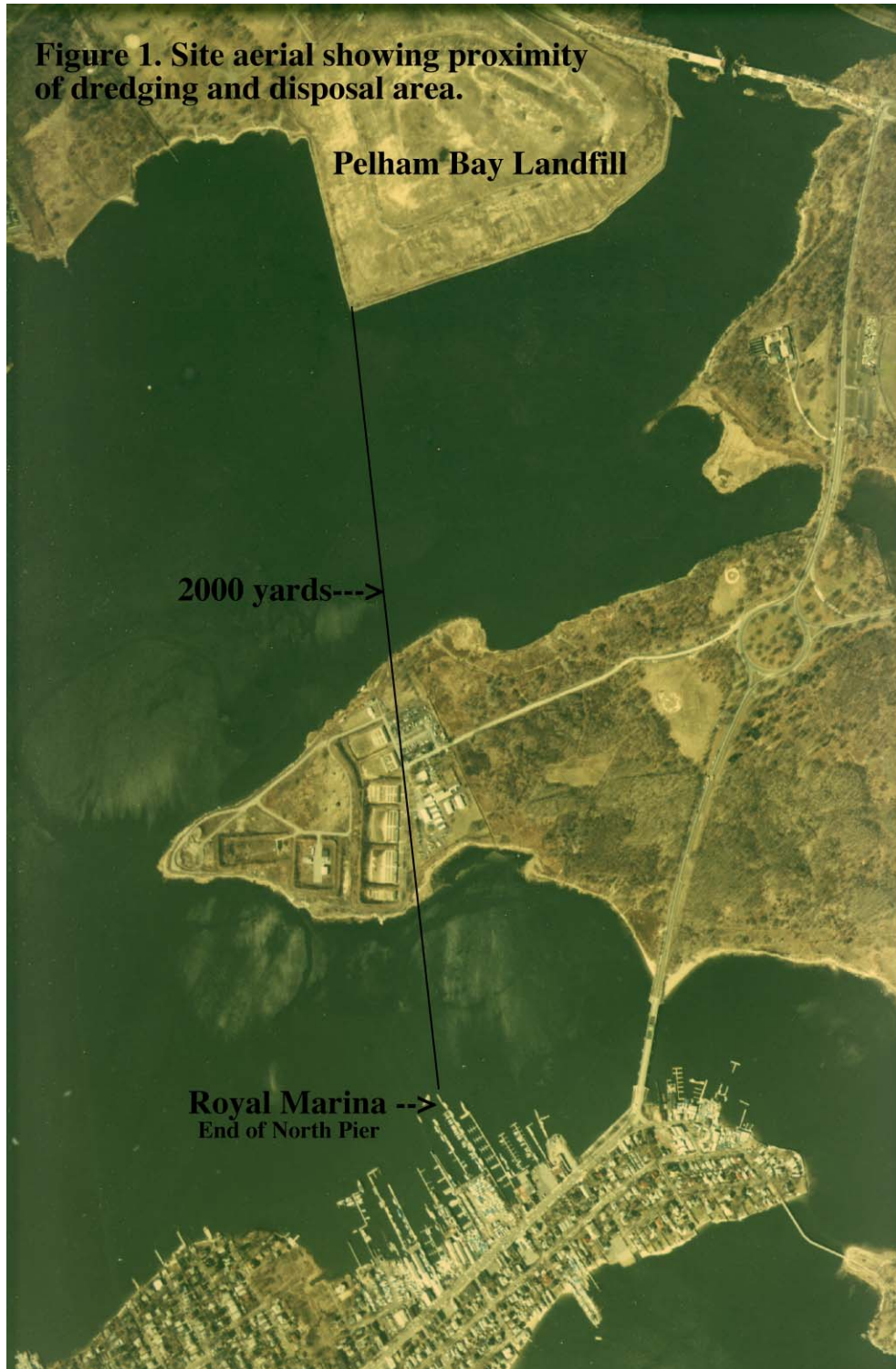
Figure 1. Site aerial showing proximity of dredging and disposal area.